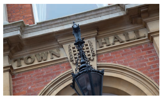
and will be paid every two weeks.

These grants can be paid after two weeks of closure,